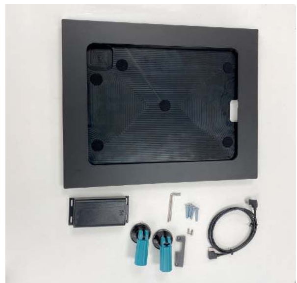
level with PoE Adapter („level PD“)